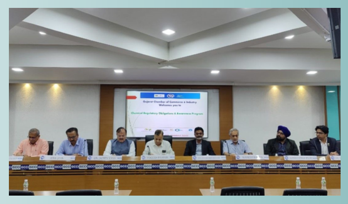
11-Feb Ahmedabad - Compliance Ready 2023