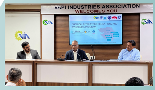
06-Feb Vapi- Regulation Ready 2023