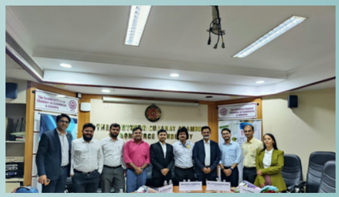
07-Feb Surat- Regulation Ready 2023