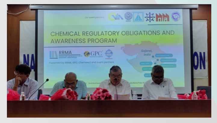
10-Feb Vadodara - Compliance Ready 2023